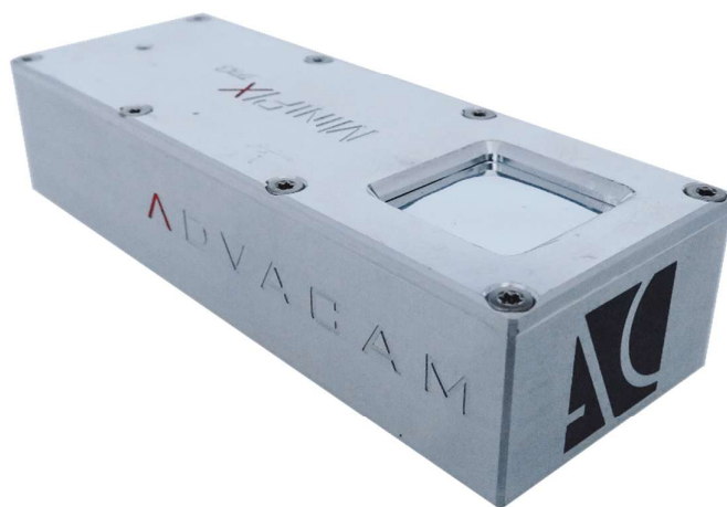
The MINIPIXTPX3_SPACE is a miniaturized and low power radiation camera equipped with Timepix3 chip for particle tracking and imaging is already on board of the ISS and several satellites.

Temperature stabilization is strongly recommended for consistent results. Passive cooling of the device is necessary and can be done by mechanical design. For active cooling attaching a Peltier cooling or cooling plate at the back of the detector should serve the purpose. The temperature should be set to one used for calibration.