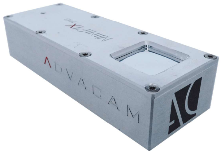
The MINIPIX TPX3_SPACE is a miniaturized and low power radiation camera equipped with Timepix3 chip for particle tracking and imaging is already on board of the ISS and several satellites.

Temperature stabilization is strongly recommended for consistent results. Passive cooling of the device is necessary and can be done by mechanical design. For active cooling attaching a Peltier cooling or cooling plate at the back of the detector should serve the purpose. The temperature should be set to 22°C.