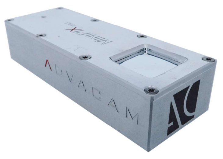
The MINIPIX<sub>TPX3_SPACE</sub> is a miniaturized and low power radiation camera equipped with Timepix3 chip for particle tracking and imaging is already on board of the ISS and several satelites.

stabilization Temperature is strongly recommended consistent results. Passive cooling of the device is necessary and can be done by mechanical active design. For cooling attaching a Peltier cooling or cooling plate at the back of the detector should serve purpose. The temperature should be set to 22°C.